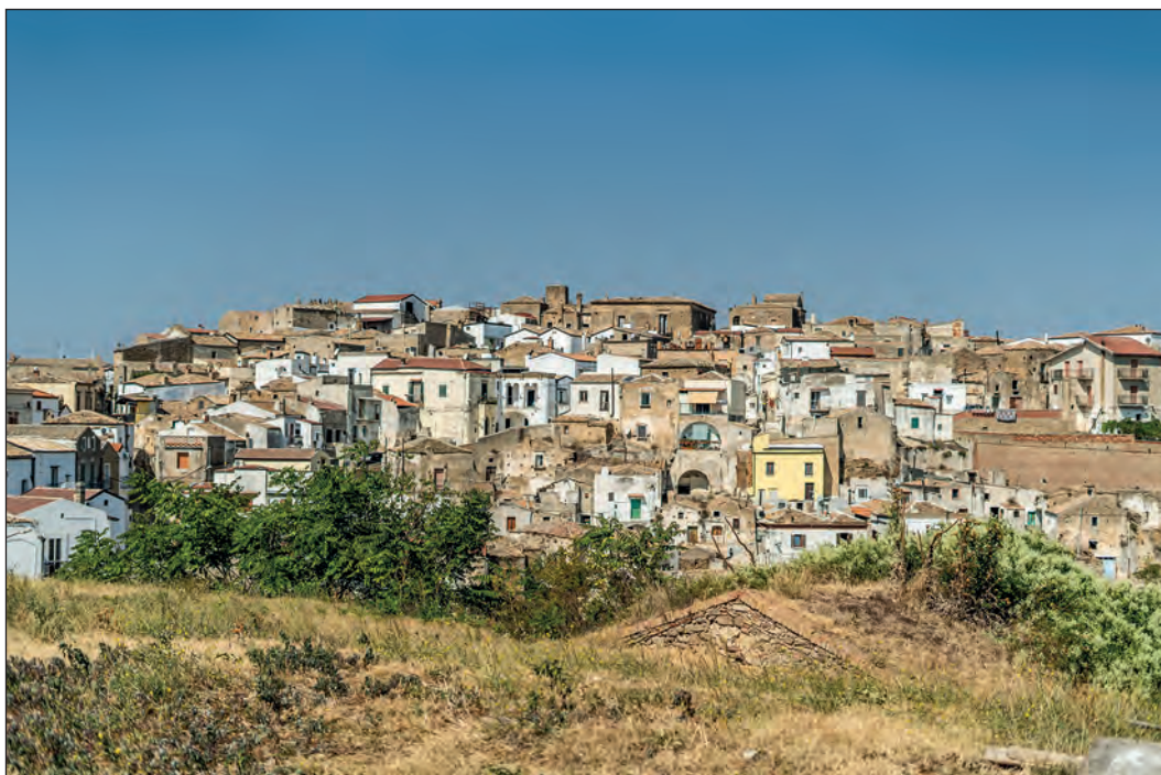
Grottole, Italy. A hilltop village.