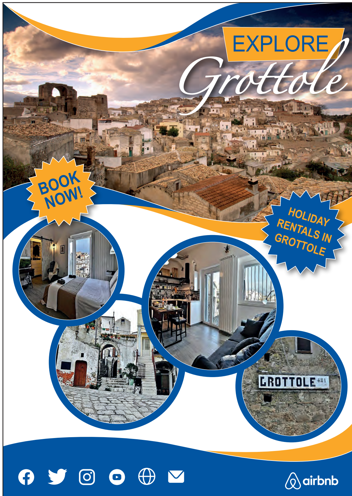
Figure 5 – Some of the houses in Grottole are being rented out as holiday homes.